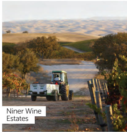
Niner Wine Estates